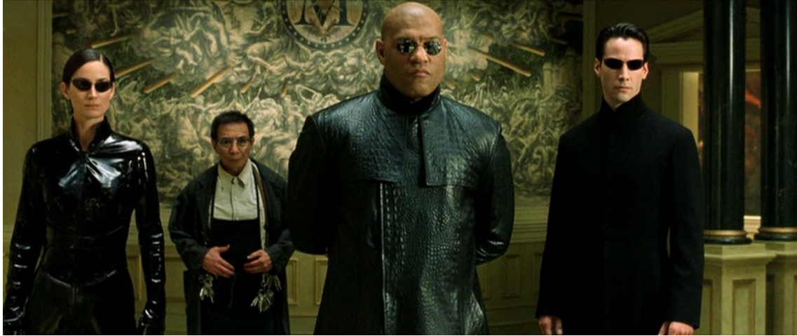
Again, as-is and corrected to proper aspect ratio: